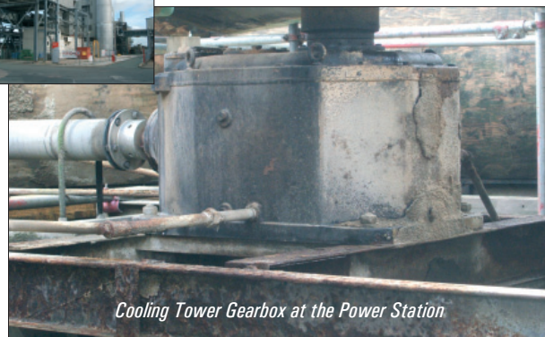
Cooling Tower Gearbox at the Power Station