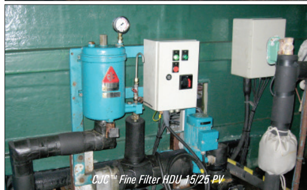
CJC™ Fine Filter HDU 15/25 PV